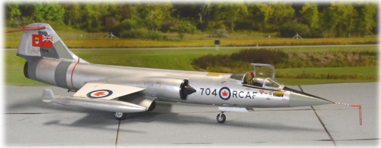
Model of CF-104 "12704" by Gilles Pepin